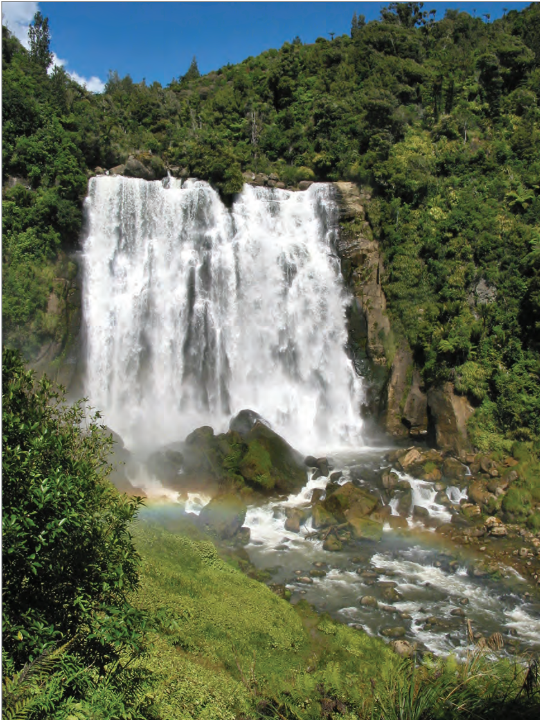
Marokopa Falls, Waitomo